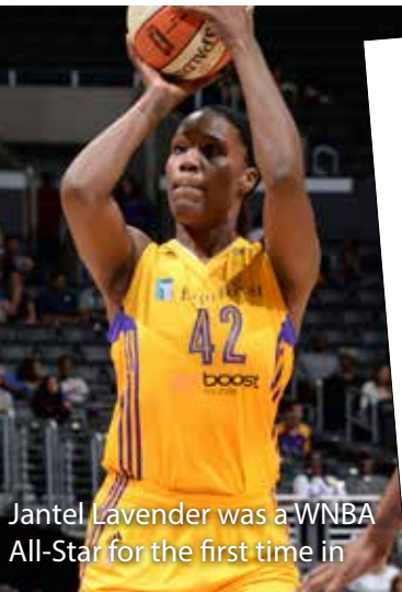
Jantel Lavender was a WNBA All-Star for the first time in