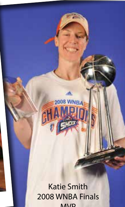
Katie Smith 2008 WNBA Finals MVP