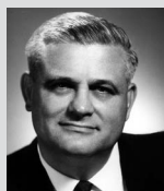
Woody Hayes 1951-1978 205-61-10 (.761)