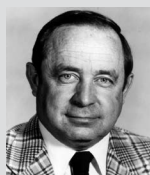
Earle Bruce 1979-1987 81-26-1 (.755)