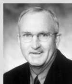
John Cooper 1988-2000 111-43-4 (.715)