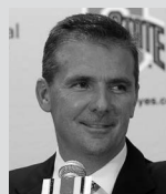
Urban Meyer 2012-present 73-8 (.901)